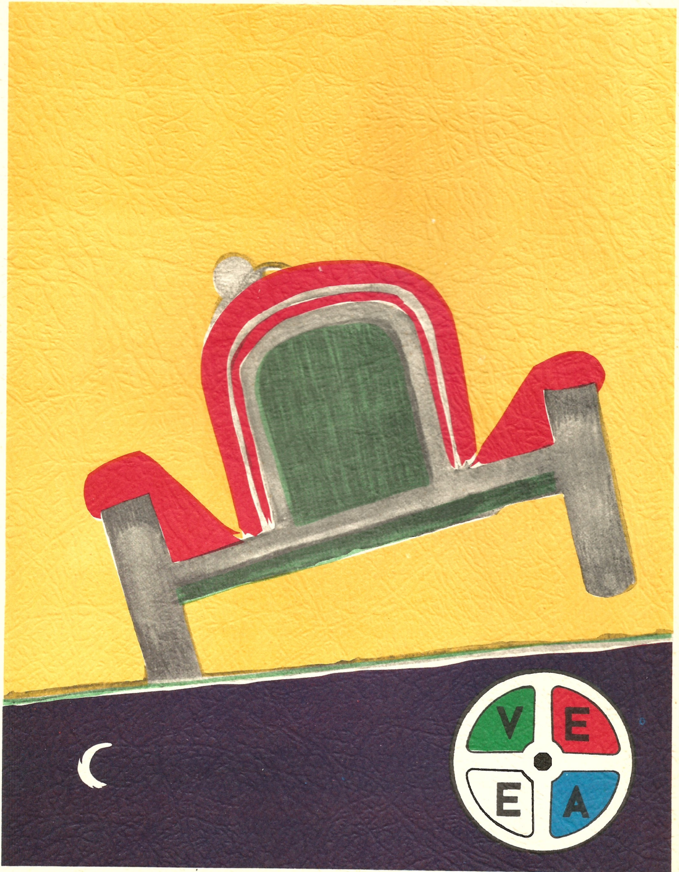
Leonetto Cappiello 1875-1942

EVEA b.p. 282, VMR, Montréal. VEAE p.o. box 282, TMR, Montreal.